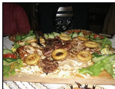
Typical meal in Bansko

The base of the mountain (3000 feet) is at the edge of town and within walking distance of most hotels. All hotels have shuttles to/from the gondola, which is the only way to access the mountain. There are over 40 miles of runs accessible by 14 chair lifts. Chip-card ski passes are wonderful! You never have to take it out of your pocket or have it hanging from your clothing! There are 3 restaurants areas on mountain with wonderful food and