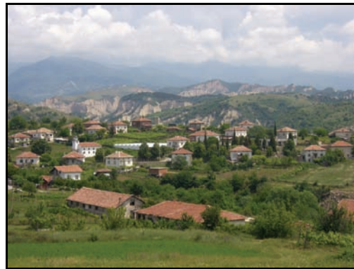
Wine country around Bansko

Bansko, the ski village of about 10,000, is small and very easy to get around. The hotels are well located and are certainly equal to if