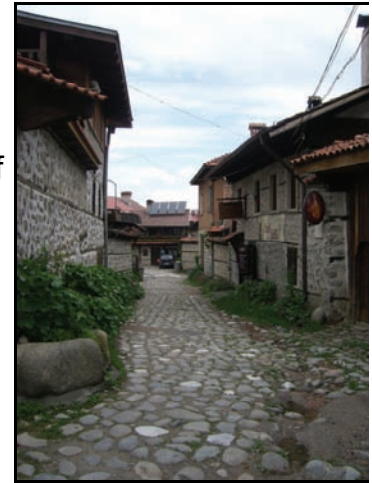
Street in medieval Bansko

back from over 700 years of dominance from outside forces. There is still some physical evidence of the Russian dominance – buildings and roads, but this is seen mainly in the large cities. The Bulgarian people have never lost themselves or their pride of country. They are warm, friendly and eager to please. And many speak English.