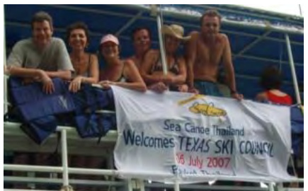
Sea kayaking in the Andaman Sea, Thailand

In a land where the locals wear yellow most every day to show love for their King, (the Kings favorite color) we were most welcomed.