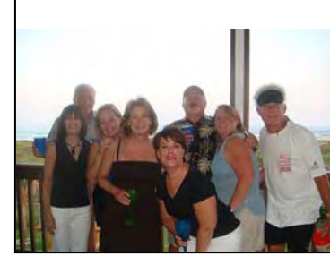
More photographs from this year's Summer Meltdown.