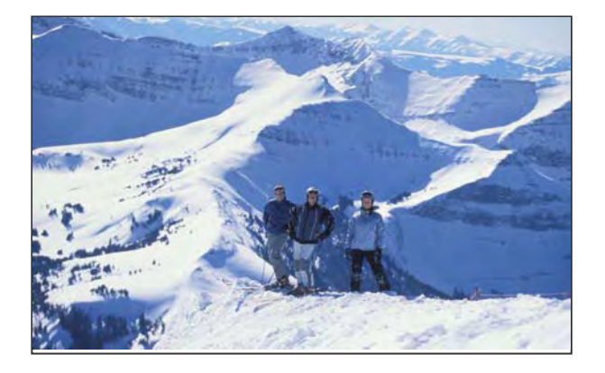
Dig deeper..... See what's at Big Sky!

Mountain adventure – rather than a beseen scene – remains Big Sky's focus, so it's not Continued on next page, see Big Sky.