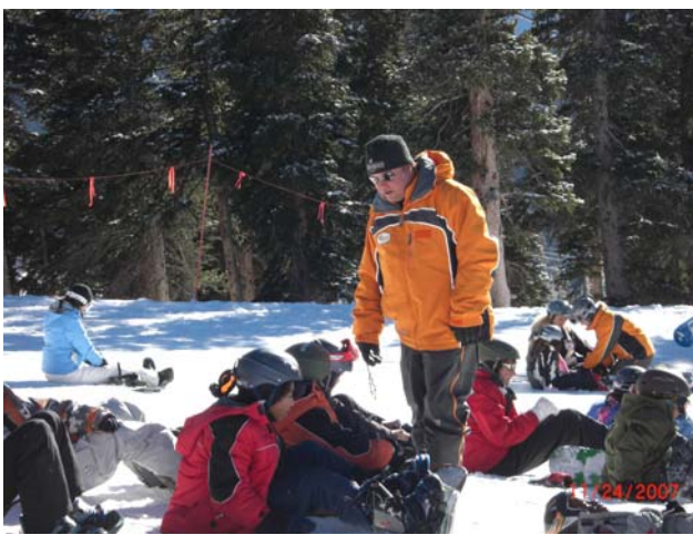
Boarding lessons at Keystone.

Texas Ski Council 5203 Cloudcroft Dr. Austin, TX 78749