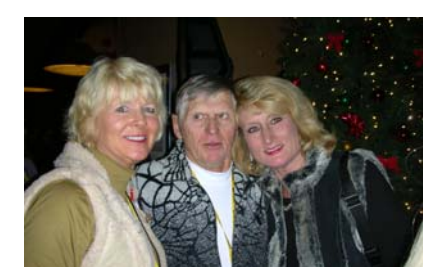
Vail Welcome Party