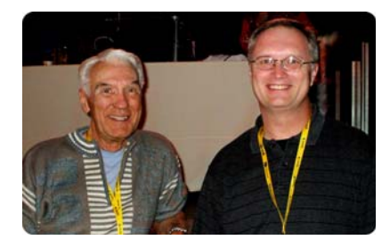
Vail Never Ever Skiers!