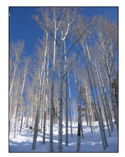
Another beautiful day in paradise - Steamboat, CO.