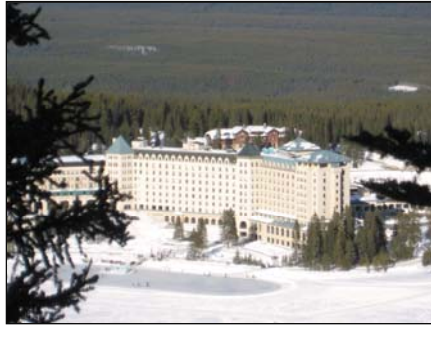
View of the Chateau from Fairview Lookout.