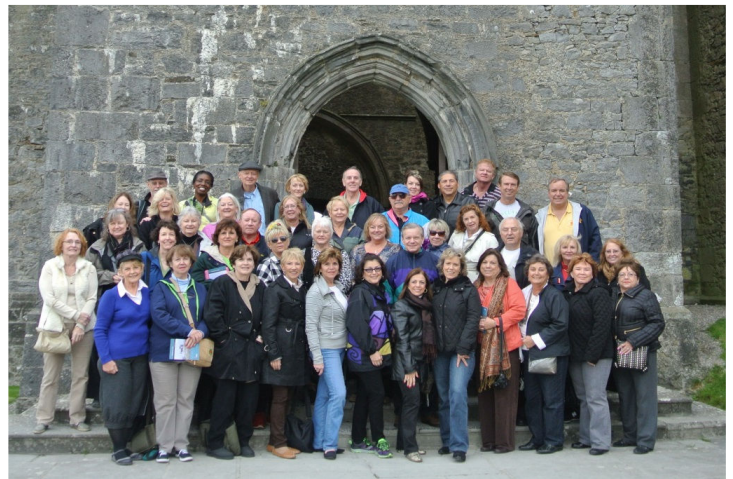
Spa City Ski Club at the Rock of Cashel