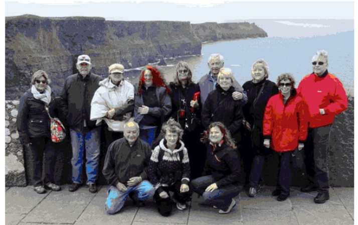
Club Saint Bernard at Cliffs of Moher