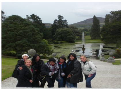
Twisters & Jammers at Powerscourt Gardens

The Emerald Isle will never be the same since 271 Texans descended upon Limerick and Dublin. We truly experienced 40 Shades of Green. The country side was magnificent, the tours were amazing and the shopping was non-stop. And of course there were Pubs, Pubs and more Pubs. We started with a visit to the Newbridge Showrooms and Museum of Style Icons, the premier silverware and jewelry producer in Ireland. The museum had a permanent collection of memorabilia and costumes belonging to Audrey Hepburn, Marilyn Monroe, Grace Kelly and other idols of the silver screen. We next made a visit to the National Stud and Japanese Gardens, with 958 acres of land. This was our first experience of Irish rain. But this did not deter the Texans from experiencing the scenery. We knew to carry our raincoats and umbrellas. However, we did experience a bit of Irish liquid sun throughout the week!