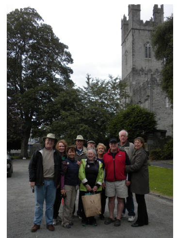
Flatlanders & Twisters