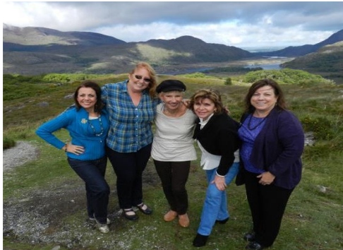
"Irish" Lasses at the Lakes on the Ring of Kerry

127 Texans visited Edinburgh, the Scottish capital and one of Europe's most attractive and historic cities. Participants visited the Edinburgh Castle, perhaps the most famous of all Scottish Castles, and the Royal Yacht Britannia which was the home at sea for the Royal Family. Some participants enjoyed days of leisure, golfed and enjoyed the local scenery while others participated in tours such