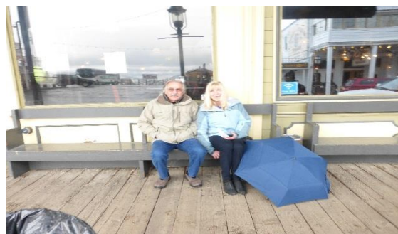
WAITING FOR BUS AND OUR SCENERY ON THE WAY BACK TO HEAVENLY