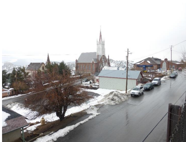
THE STREETS WERE WET, SO WE HEADED FOR THE BAR!