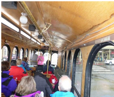
TROLLEY CAR RIDE VIRGINIA CITY