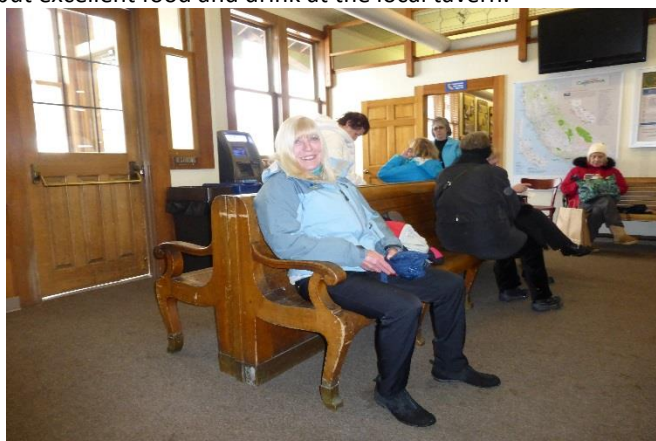
IN TRUCKEE WAITING FOR THE BUS BACK TO NORTHSTAR

By Tuesday morning, the winds were making it too challenging (80 mph winds) and the Canyon lift had gone on wind hold. That lift was required for you to access the Epic Race venue. They had 10 more inches of snow and it was dumped after the slopes had been groomed, so races were cancelled until Friday.