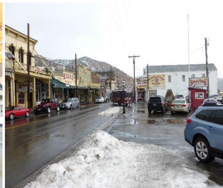
MAIN STREET IN VIRGINIA CITY